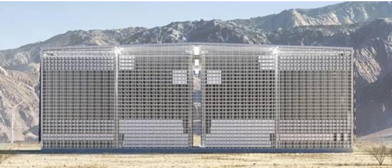
Long-term gravity energy system storage, with capacity to hold energy for 12 hours and more

AQ Group is searching for competitively priced, high-efficiency industrial batteries for power storage from 50 to 500 MW or more, with power storage and release times of 6 to 12 hours or more.