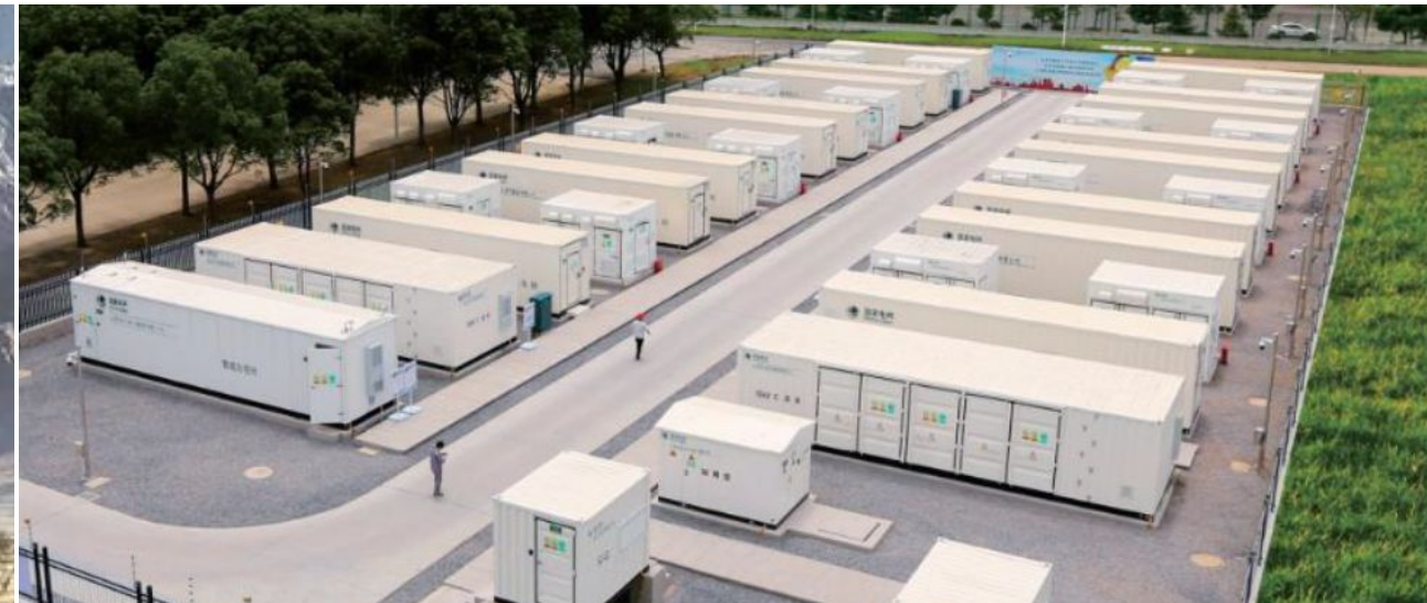
Traditional lithium-ion (Li-Ion) or lithium iron phosphate batteries (LiFePO 4 )

The company plans to implement advanced energy storage systems (BESS) technologies to future projects. The company is also considering construction of a battery energy system storage factory with leading energy storage developers on the territory of the Republic of Kazakhstan.